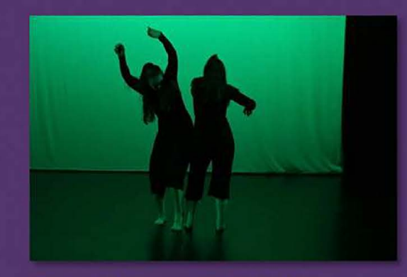
Top tips for young people