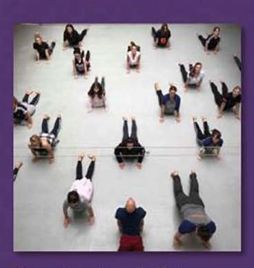
Top tips for Advisers