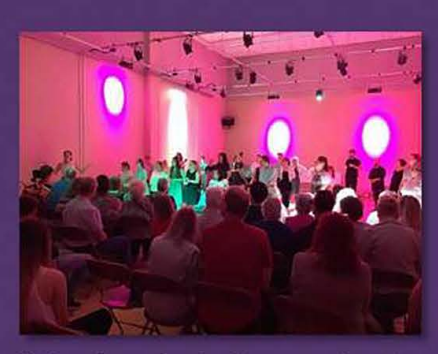
Meeting Industry professionals