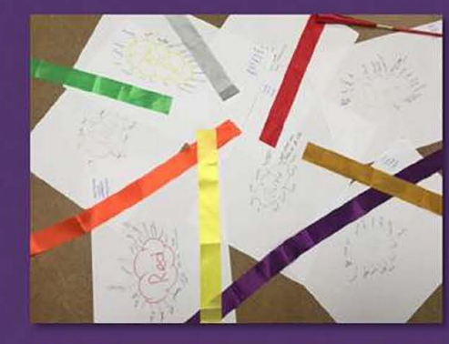
Working with my Adviser